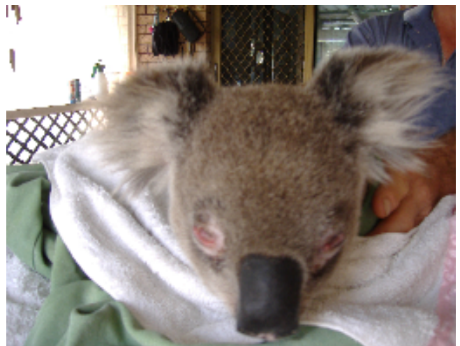
'Cookie' - two days after surgery