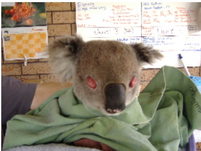
'Cookie' - unable to see anything