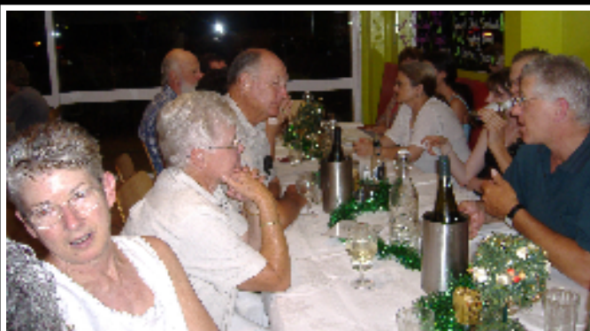
Christmas Party - everyone engrossed in conversation